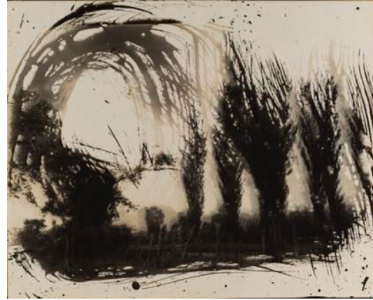
Left: TABAIMO, aitasei-josei , 2015. Video installation. © Tabaimo, courtesy Gallery Koyanagi. Right: SHIGERU ONISHI, Title unknown , 1950s. Gelatin silver print, 55.9 x 45.5 cm. © Estate of Shigeru Onishi, courtesy MEM.

Across the spectrum, Art Week Tokyo's 40 participating galleries are presenting an incredible lineup of exhibitions, featuring some of the biggest names in Japanese contemporary art as well as a strong representation of leading female artists. These include: