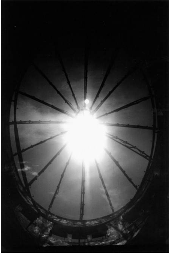
KIKUJI KAWADA, Atomic-Bomb Dome and Sun , from The Map , 1959–65. Gelatin silver print, 107 x 73.3 cm.