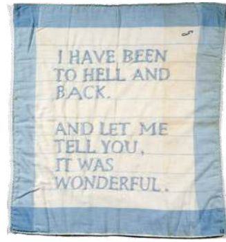
Left: KEIICHI TANAAMI, The Story of Death and Rebirth, 2019. Pigmented ink, acrylic silkscreen medium, crushed glass, glitter acrylic paint, acrylic paint on canvas, 200 x 400 cm (quadriptych). Right: LOUISE BOURGEOIS, Untitled (I Have Been to Hell and Back), 1996. Embroidery on handkerchief, 49.5 x 45.7 cm.

This year Art Week Tokyo engages 13 institutions and 40 galleries and art spaces across the city, including first-time participants Chanel Nexus Hall, Pace, and Prada Aoyama.