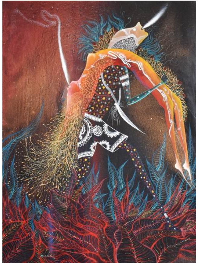
REMBER YAHUARCANI, Conquest of the Rainbow Woman , 2024. Acrylic on canvas, 120 x 90 cm.

All venues are connected by the free AWT Bus service, with buses running every 15 minutes between 10am and 6pm across multiple routes.