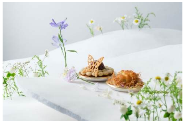
LEFT: EIKO TOMURA, Concept image for the AWT Bar 2024. © eiko tomura landscape architects. Right: MIYA ENMEIJI, Tatin Mont Blanc and Burdock Root and Bacon Cake Salé for AWT Bar 2024.